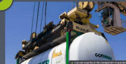
A proven expertise in the management of operators