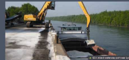
GCA inland waterway partner Lyon