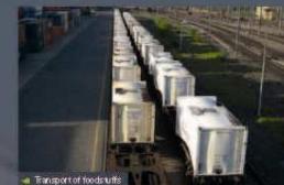
Transport of foodstuffs